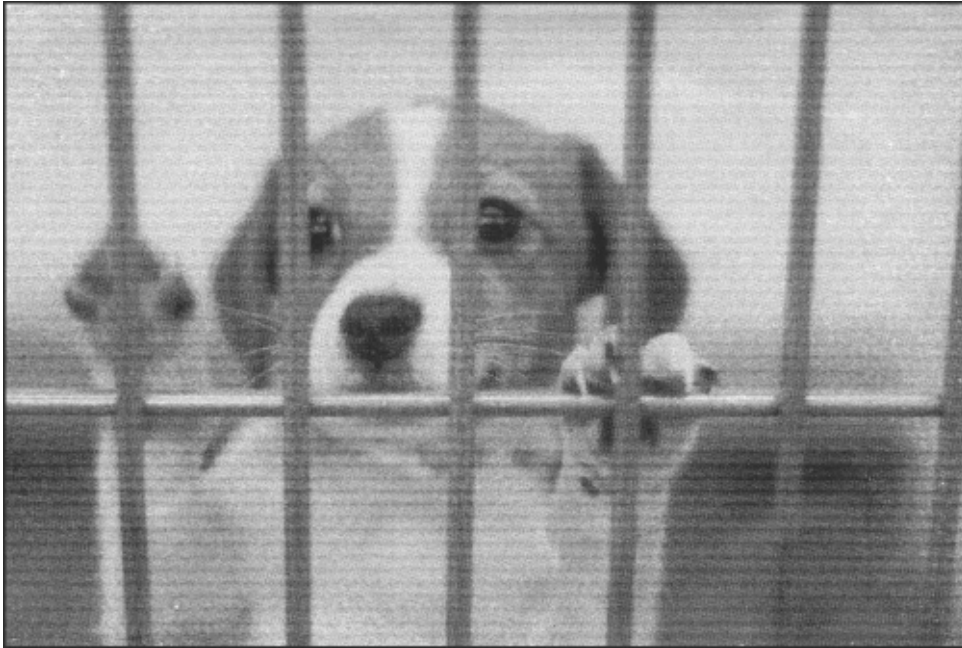
A Puppy in a Kennel